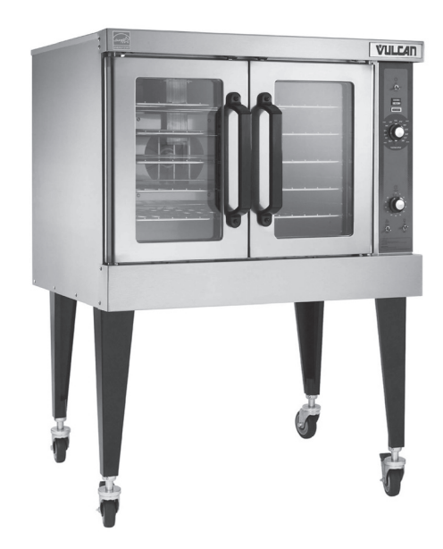
Model VC4GD Shown on optional casters