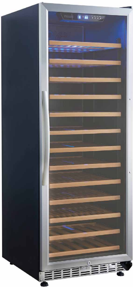
USF128S - Single Temperature