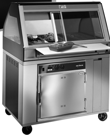
EU2SYS-48 Back view shown with 750-TH-II Cook & Hold oven and optional casters