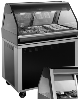
EU2SYS-48 front view shown with optional casters