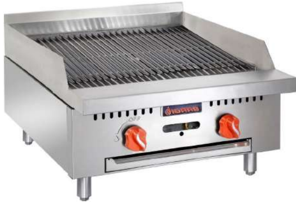
MODEL SRRB-24 (Pictured above)