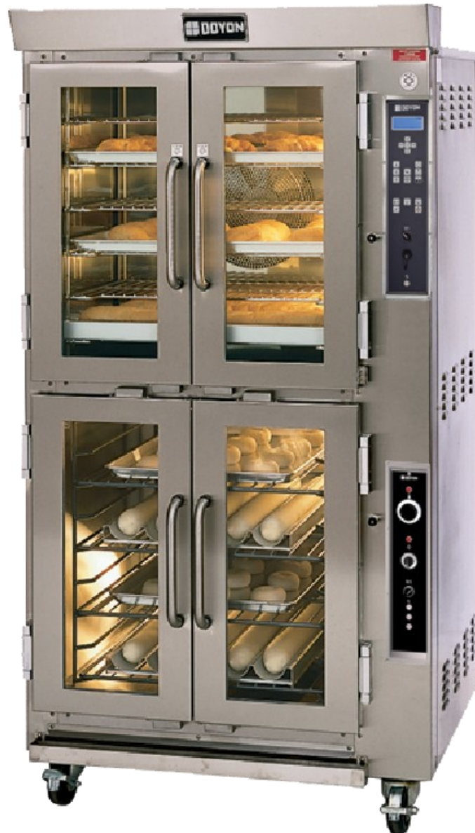
Jet Air Oven/Proofer Combination, Electric, Capacity (6) 18"x26" Pans, Side Loading, Steam Injection, Reversing Fan System, Digital Temperature Control and Timer, (9) Pan Proofer with Auto Water Fill, Glass Doors, Stainless Steel Construction, Casters, cETLus, NSF