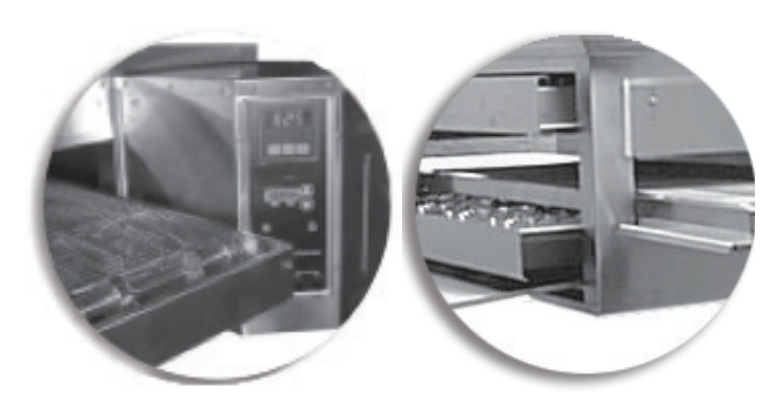
Removable panels for easy cleaning