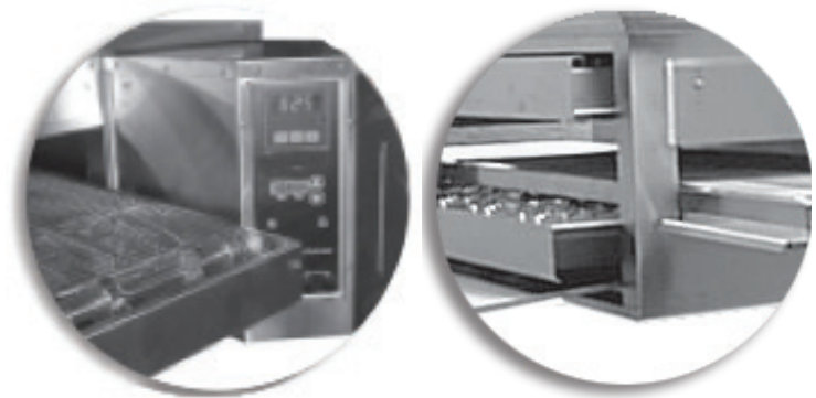
Removable panels for easy cleaning