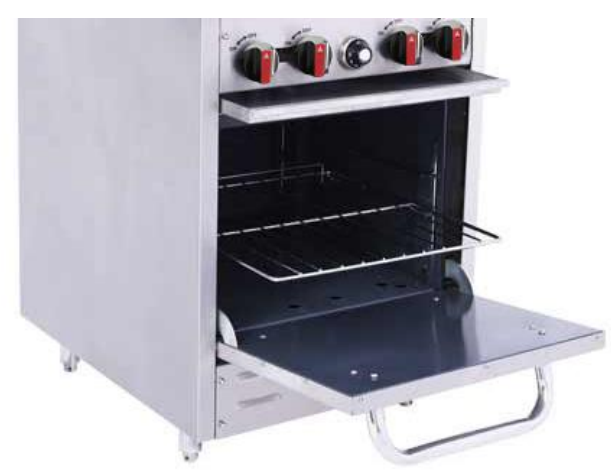
Removable Crumb Tray & Oven Door

The BakeMax America BAS24O – 4 Burner Gas Range is designed to provide the ultimate in performance and durability. Allowing you to roast and cook a wide range of meals, with efficiency, convenience at an affordable price.