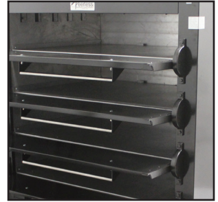
Adjustable Dampers at each deck