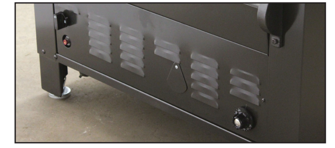
Easy access front controls