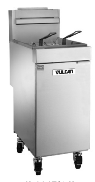
Model 1VEG35M Shown with caster accessories